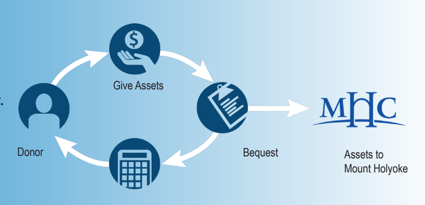
Estate Tax Deduction

Taxable estates begin at $13,990,000 ($27,980,000 for married couples). Note that this is for those dying in 2025. The amounts are adjusted for inflation each year.